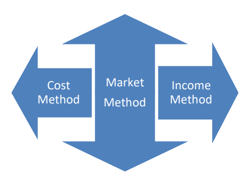
Figure 1 Valuation Methodologies

the past and value assets based upon the costs of development of the assets. In practice, these methods are used in combination and a value can be determined in response to the results obtained by the different methods.