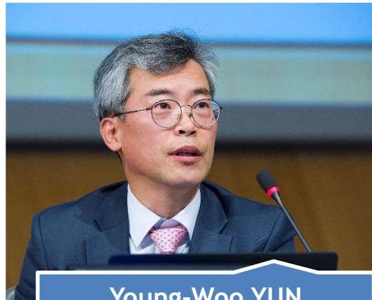
Young-Woo YUN Head, Standards Section, WIPO (CH)