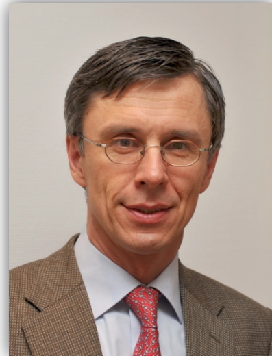
Judge of the German Federal Court of Justice (Bundesgerichtshof)