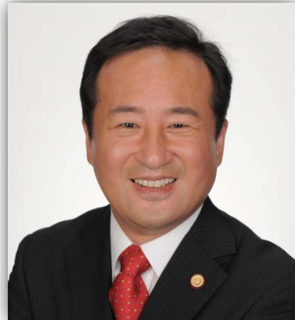
FICPI Training & Education Commission