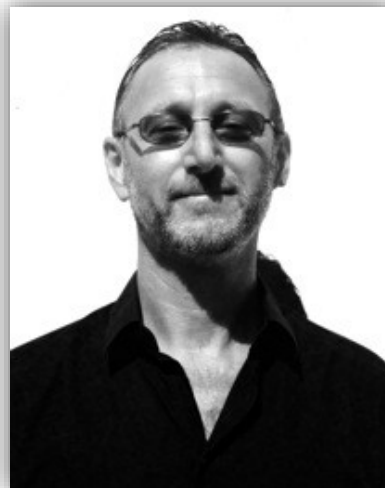
FICPI CET 5 – Inventions – Sub Chair (Life Sciences)

He frequently lectures on intellectual property both in Italy and abroad. He has published several articles on "Il Sole-24 Ore", "Pharmachem" and "Il Diritto Industriale".