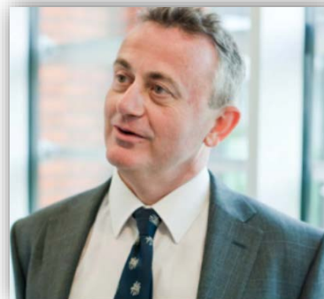
FICPI Professional Excellence Commission

He is a member of EPO Disciplinary Board of Appeal, Immediate Past-President of the Biotechnology Commission of UNION, and a committee member of the CIPA Benevolent Association.