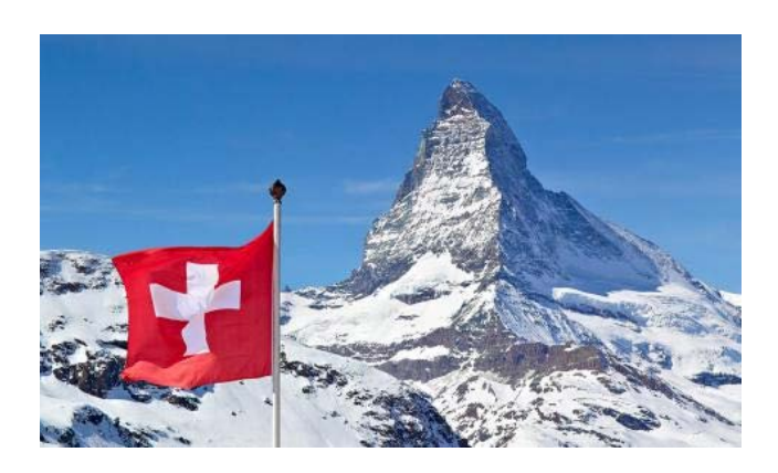
I don't know, but their flag is a HUGE PLUS!»