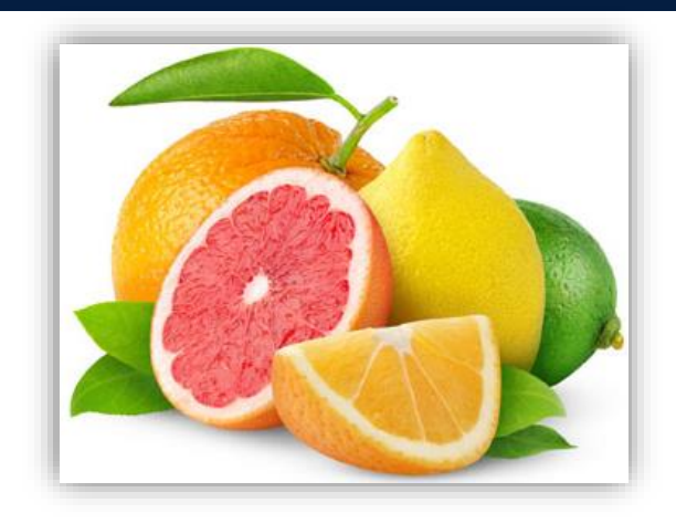
P1 – 1 Mar 16